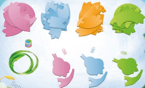
Setup for a 3-player game

The oldest player takes the measuring ribbon and the wooden die. This player also begins the game.